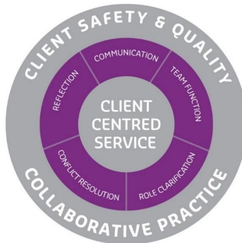
FIGURE 1: The interprofessional capability framework which outlines the learning outcomes (Brewer & Jones, 2013).

contact hypothesis, contact theory argues several variables impact on the quality of interactions between members of different groups. Contact theory has been adapted for interprofessional education (Bridges & Tomkowiak, 2010; Mohaupt et al., 2012) to help address the hierarchies evident in health (e.g., doctors, nurses and allied health professions) (Braithwaite et al., 2016) and the siloed nature of health education (Abu-Rish et al., 2012). Carpenter and Dickinson (2016), for example, argue that six conditions must be present to facilitate effective interprofessional collaboration. All six conditions informed the design of the learning for the interprofessional fieldwork program explored in this paper (see Table 1).